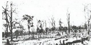
HOW SHIFT FARMING OF SESAME CROP POSES A THREAT TO FORESTS PAGE 7