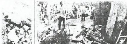
ILLEGAL 4 NATIONAL ROAD SAFETY WEEK ENDS ON A SAD NOTE PAGE 5