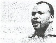
MTIBWA SUGAR EYE TO ADVANCE PAGE 36